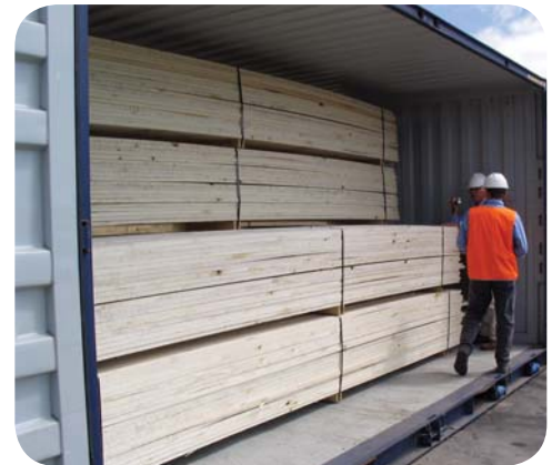
Nitens export lumber

PENTARCH FOREST PRODUCTS an integrated approach